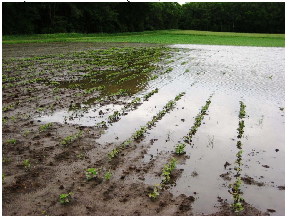
Image 1. Flooded soybean field located at Arlington WI, June 8 th 2008.

Severe flooding has many low-lying soybean fields underwater. As the water dissipates yield potential and replant questions will arise. Flooding can be divided into either water-logging, where only the roots are flooded, or complete submergence where the entire plants are under water (VanToai et al., 2001). Water-logging is more common than complete submergence and is also less damaging. Soybeans can generally survive for 48 to 96 hours when completely submersed (Image 1). The actual time frame depends on air temperature, humidity, cloud cover, soil moisture conditions prior to flooding, and rate of soil drainage. Soybeans will survive longer when flooded under cool and cloudy conditions. Higher temperatures and sunshine will speed up plant respiration which depletes oxygen and increases carbon dioxide levels. If the soil was already saturated prior to flooding, soybean death will occur more quickly as slow soil drainage after flooding will prevent gas exchange between the rhizosphere and the air above the soil surface. Soybeans often do not fully recover from flooding injury.